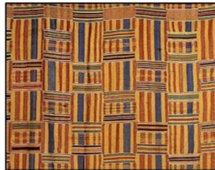
Traditional kente cloth